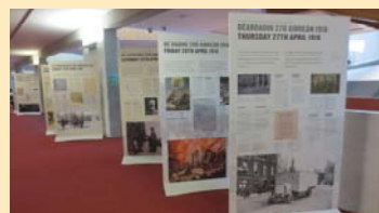
Case Studies of the 1916 Rising exhibition