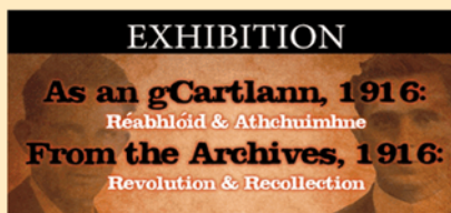
From the Archives, 1916 : Revolution and Recollection exhibition